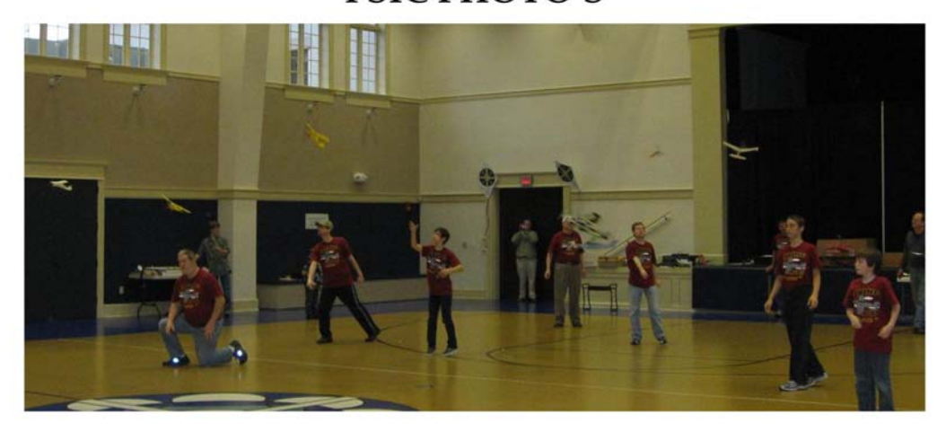
Civilian Sudden Death Mass Launch