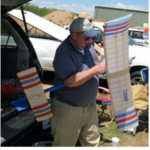
Graham's New Bastard Pearl and Super Tiger 15