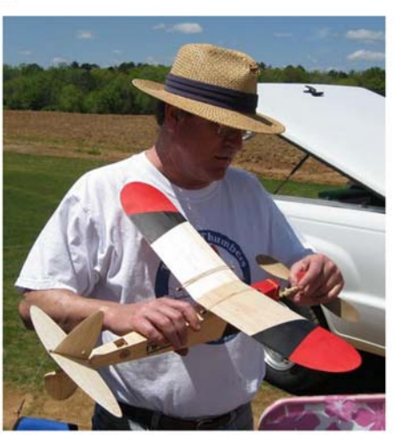
Your Editor's New Lidgard Foo Gets A New Motor