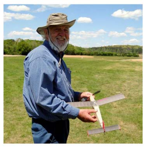
Gary's Veteran Embryo