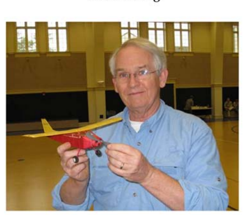
Dohrman's DB4 peanut