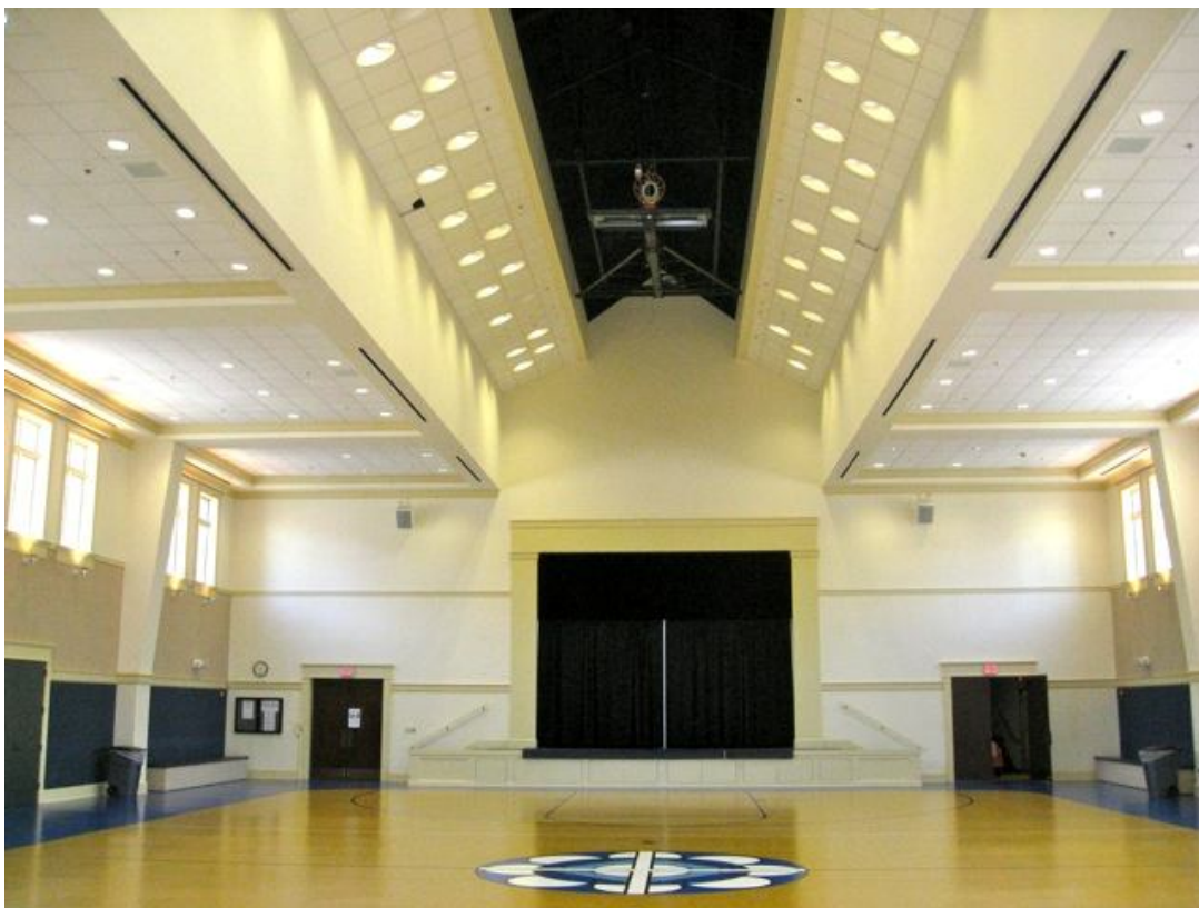
The Great Hall at St. Luke's Presbyterian Church, Dunwoody, GA

Flying heavyweight models (No-Cal or heavier) in lightweight periods always requires CD's permission prior to winding and/or launch. Flying lightweight models during heavyweight time periods is at flier's risk. Special consideration can be given, but CD's word is final.